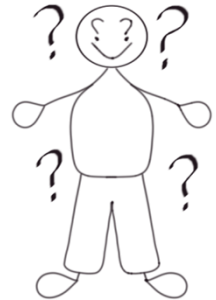
Who is this?